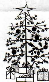
The Giving Tree

Congratulations to our students, who are making their 1 st Confession on Saturday, Dec. 5 th .